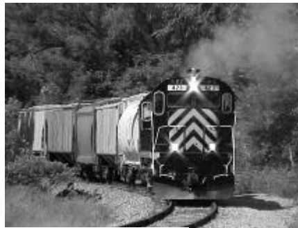
WNY & PA Train Makes Olean Turn at Kennedy, NY

“It’s been 25 years since the industries in southern Chautauqua County have seen an aggressive marketing campaign by a railroad